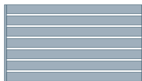
16mm spacing Air flow