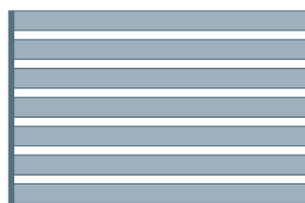
30mm spacing Visibility