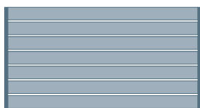
10mm spacing Privacy