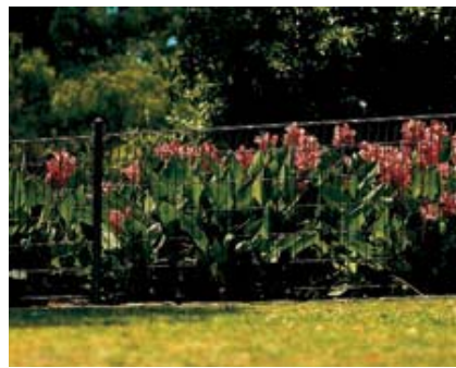
Jacaranda ™ in Black

Choose from a variety of sizes. Styles are available in both a galvanised and powder-coated finish*.