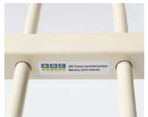
Authentic ARC Fences sticker