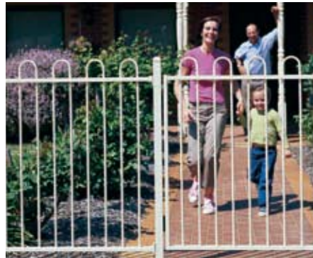
Lassiter™ in Cream

Tube size: 16mm or 19mm diameter vertical tube