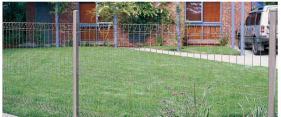
Banksia ™ in Charcoal