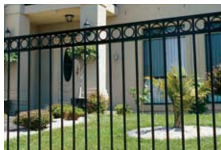
Blaxland™ in Black