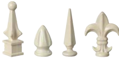
Extensive range of accessories available

ARC Fences can cater to all your fencing needs with gates and accessories to complete your new fence. Standard and made-to-order gates are available as well as posts and accessories such as post caps, spears for tubular fencing and latches.