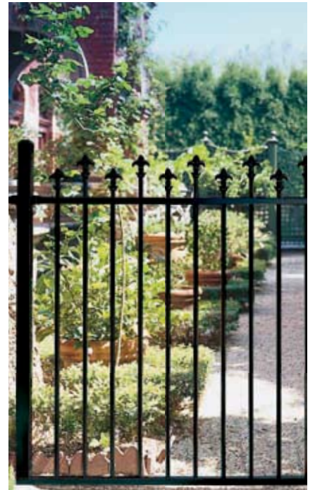
Bourke™ in Black