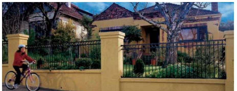
Blaxland™ in Black, set between elegant brick piers