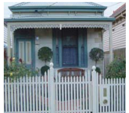
Steel Picket in Smooth Cream

Height: 600mm, 900mm, 1200mm, 1500mm and 1800mm