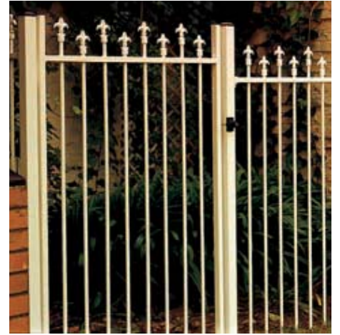
Bourke™ In Cream