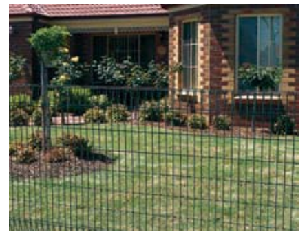
Garden in Claret