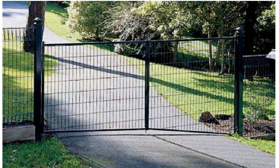
Garden in Black